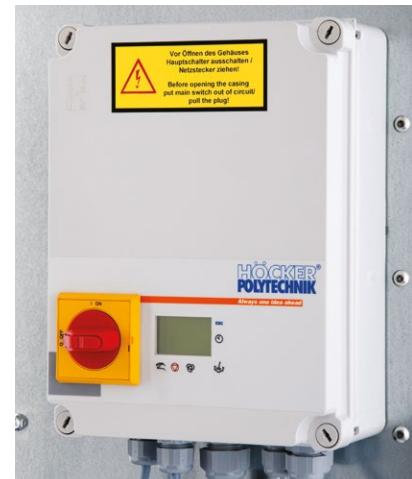
Illustration to the right: PLC controller with text display and robust membrane keyboard