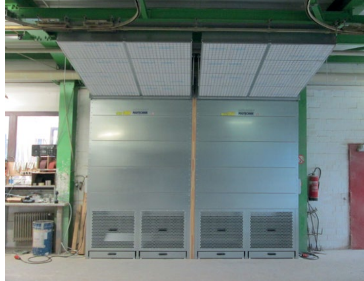
Fig.: Two DustStars in practical use (with special accessories)

Sanding and fine dust is cleaned and discharged through a 2-stage filter system with 16 m 2 filter area indoors and ~2 m 2 in the air inlet duct (M5 filter mats). The filtering is highly efficient and enables the easy recirculation* of the filtered air into the working space. This retains valuable heat energy and simplifies the installation of the DustStar. Simply set up, connect and start sanding.