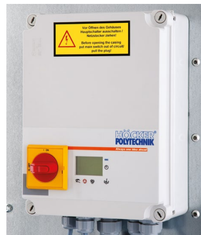
Illustration to the right: PLC controller with text display and robust membrane keyboard