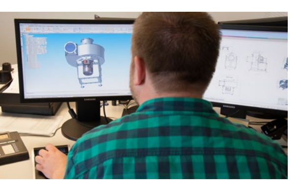
Development with Solid Edge

On request, the fan is installed and commissioned by one of the experienced HÖCKER installation teams.