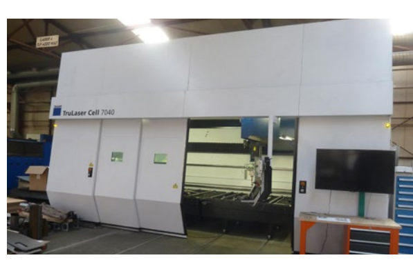
Production with modern machinery