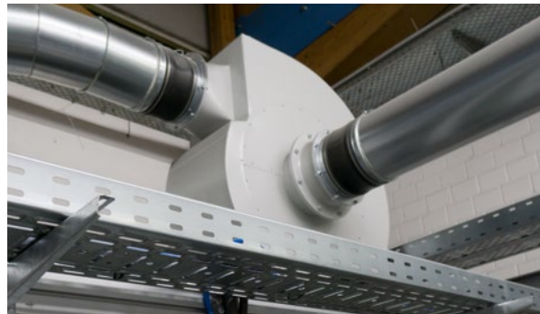
Transport fan in use